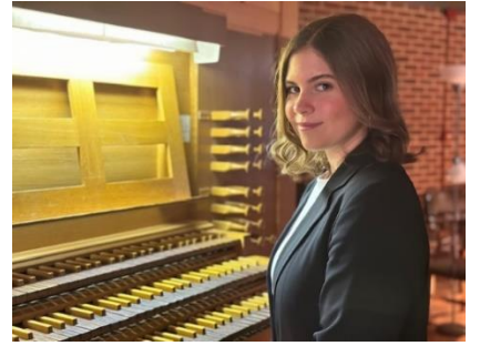
DATE: Sunday, June 23, 2024 TIME: 2:00 p.m.

Concert is free and open to the public. Please direct questions to the church office, 717-854-1184.